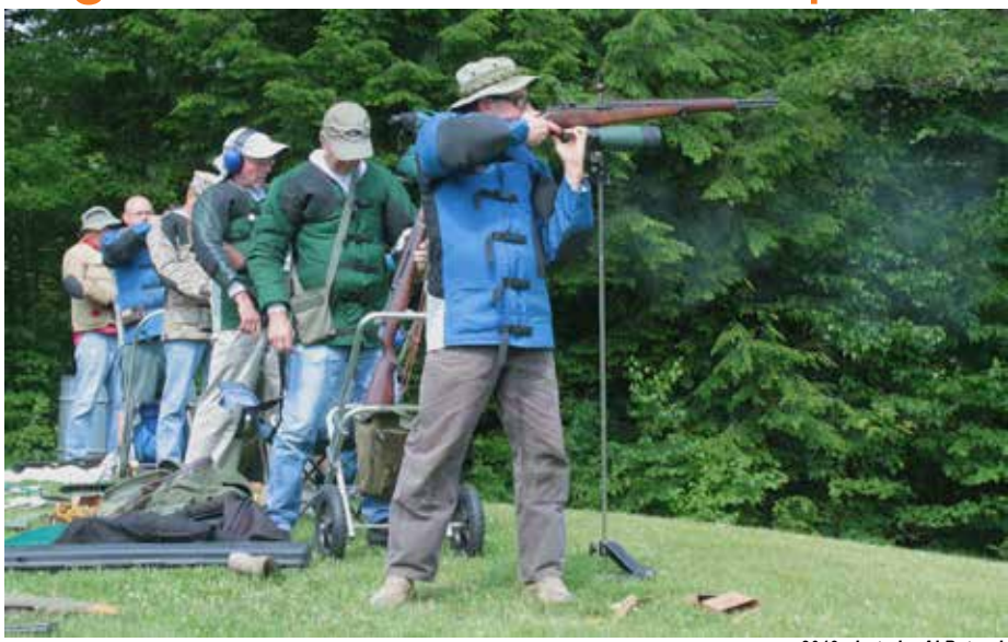
2013 photo by Al Patnode