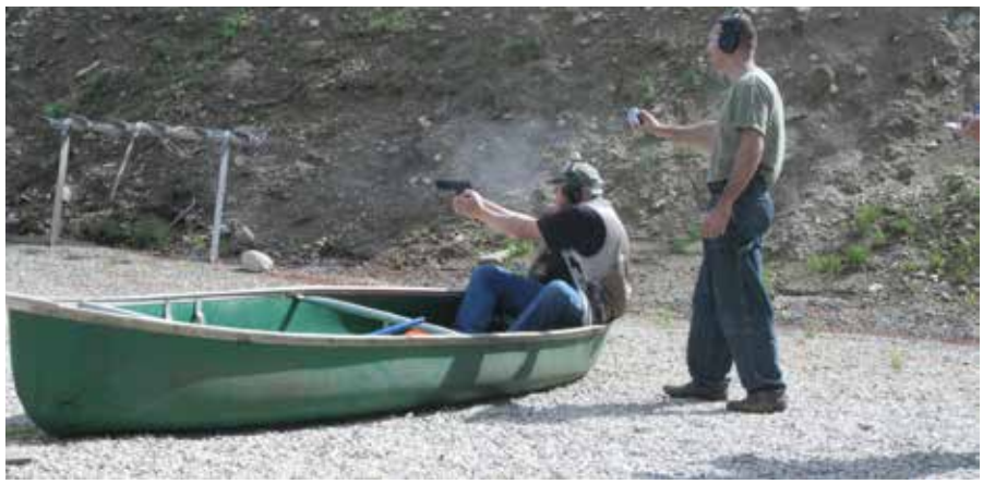
"Shoot faster... I hear banjos!"