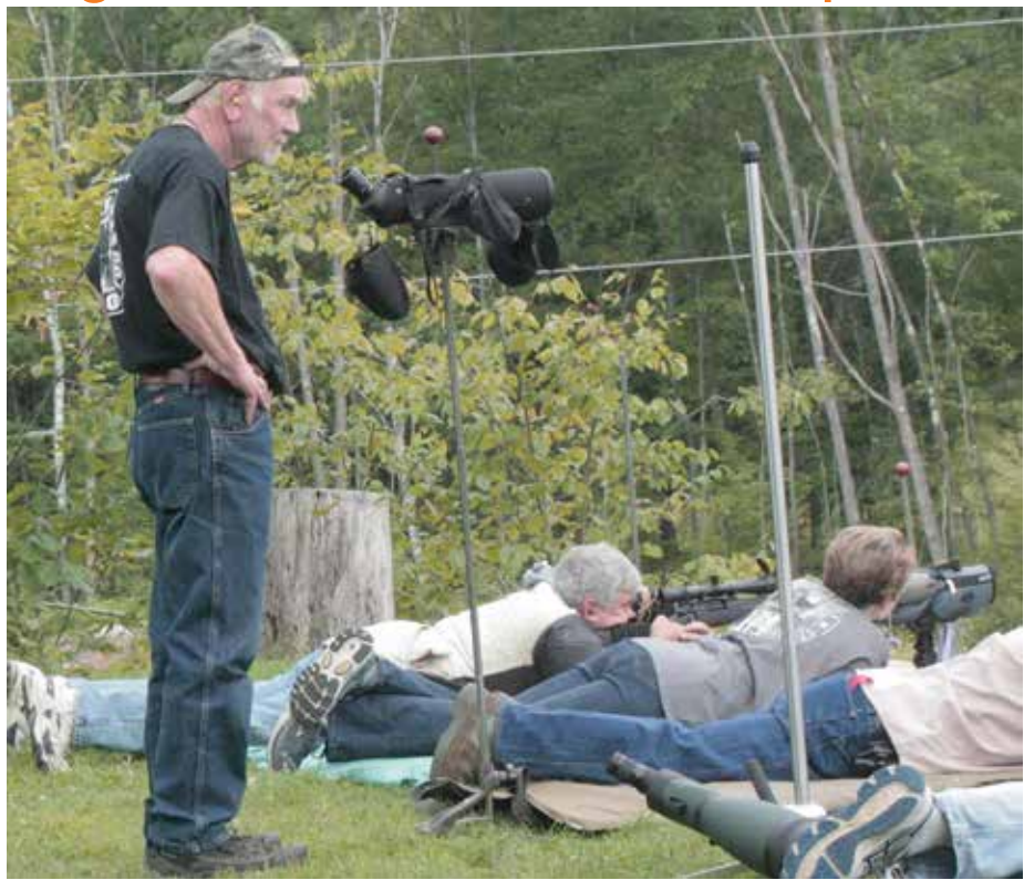
August 2014 Sniper Match, photo by Al Patnode