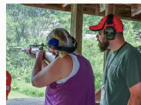
Learning rifle skills from one of our instructors