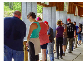
Hey, this shooting stuff is fun!