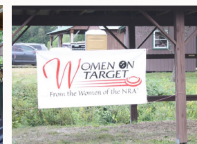
Banner tells you, you are in the right place!