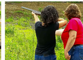
The clay bird broke! Yeah!