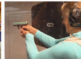
Whoops! Teacupping. Gotta fix that...