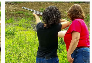
The clay bird broke! Yeah!