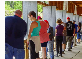
Hey, this shooting stuff is fun!

Sandals and low cut tops not recommended