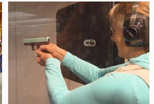
Whoops! Teacupping. Gotta fix that...