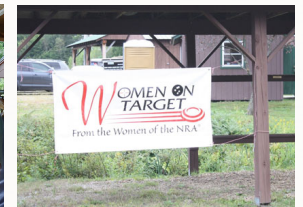
Banner tells you, you are in the right place!