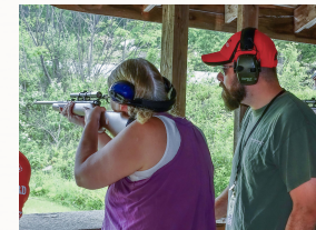
Learning rifle skills from one of our instructors