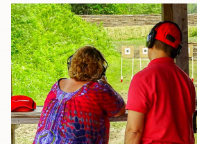
Lots of encouragement