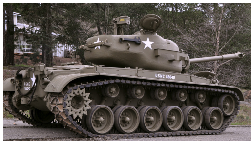
M26A1 Pershing is the ultimate tank driving opportunity. The American Heritage Museum is the only place in the world you can experience it.