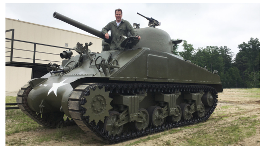
M4A3 Sherman is easily the most recognizable Allied tank of WWII. This particular Sherman starred in the movie Tank, starring James Garner! This is the world's only full dual control Sherman.

I can picture myself driving one of these bad boys up to the 600yd range on a Thursday for a little practice. Something else for the bucket list?