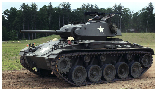
Your driving experience starts with the Chaffee M24. It has been the light tank leader through 3 wars.

Proceeds from this sweepstakes and fundraising campaign will help support the living history mission of the American Heritage Museum. A 501(c)3 non-profit educational foundation, the American Heritage Museum is committed to honoring our veterans who served, preserving, and restoring the vehicles and technology they used, and educating future generations.