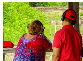
Nice tight shot grouping.