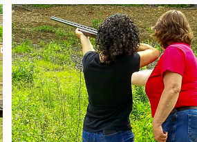
Hmmm... not bad.