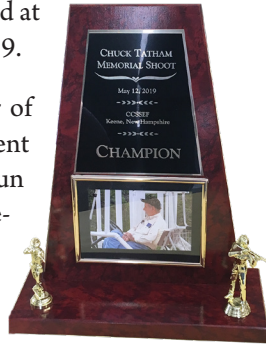
Chuck Tatham Memorial Shoot Trophy