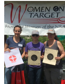
3 Generations :)