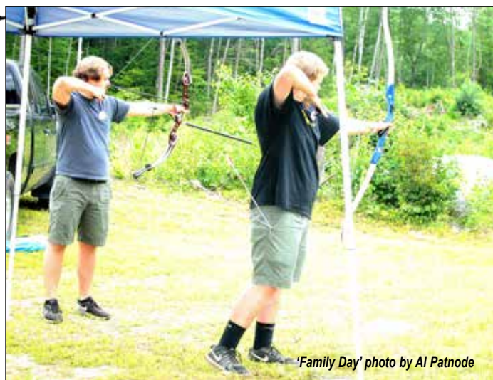
'Family Day'

Shooting a bow is a different experience from a firearm and it can be even more fun. The Rec. Center has equipment that anyone