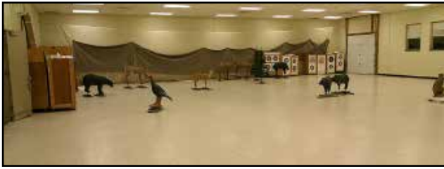
Indoor 3-D shoot at the Kene Recreation Center.