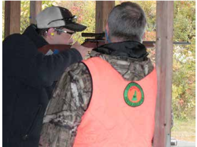
Hunter Education begins in January.

A donation can will be in the club house for the Monadnock Bass Fishing team. Thanks to all CCF&G members