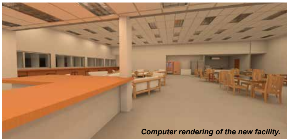
Computer rendering of the new facility.